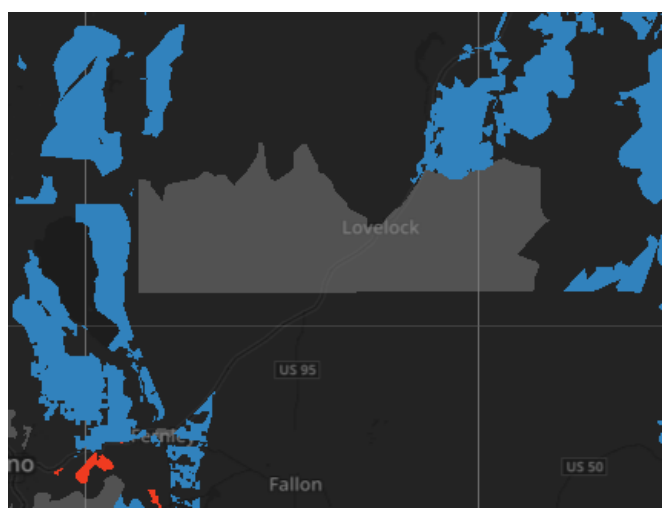
Rural Digital Opportunity Fund

The FCC recently released eligible areas for its next round of subsidies. Subsidies for the new Rural Digital Opportunity Fund (RDOF) will be awarded via a reverse auction that is scheduled to begin October 22<sup>nd</sup>, 2020. In Pershing County, there are 1386 locations eligible for up to $5.78 Million in total subsidies over a 10 year period.