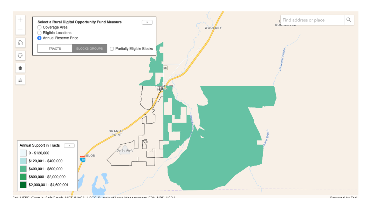
Pershing County Assistance in making application for Federal Funds

The FCC recently released eligible areas for its next round of subsidies. Subsidies for the new Rural Digital Opportunity Fund (RDOF) will be awarded via a reverse auction that is scheduled to begin October 22<sup>nd</sup>, 2020. In Pershing County, there are 1386 locations eligible for up to $5.78 Million in total subsidies over a 10 year period.